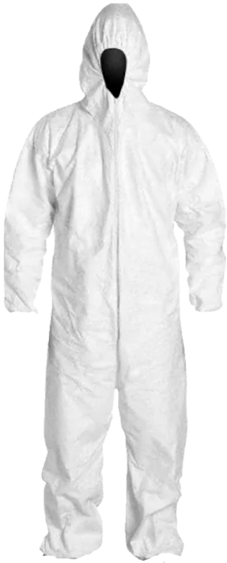
FULL PROTECTIVE SUIT